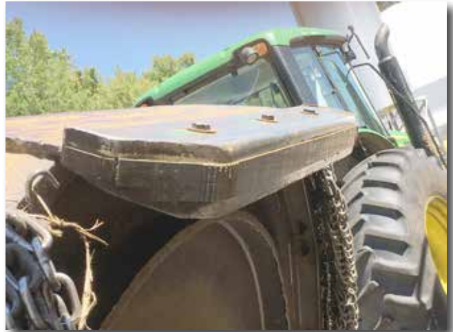
Z-Skid still going strong