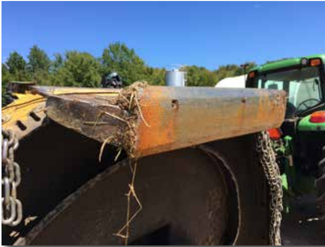
Customer skid replaced 4 times in one season

The Department of Transportation for one southeast state is reaping the benefits of applying Tungsten Carbide Z-Skids to their Bush Hogs. In one season, the OEM skid was replaced so often that the DOT was forced to use a plow blade instead of a mower skid. Meanwhile, the Z-Skid on their other mower showed minimal wear.